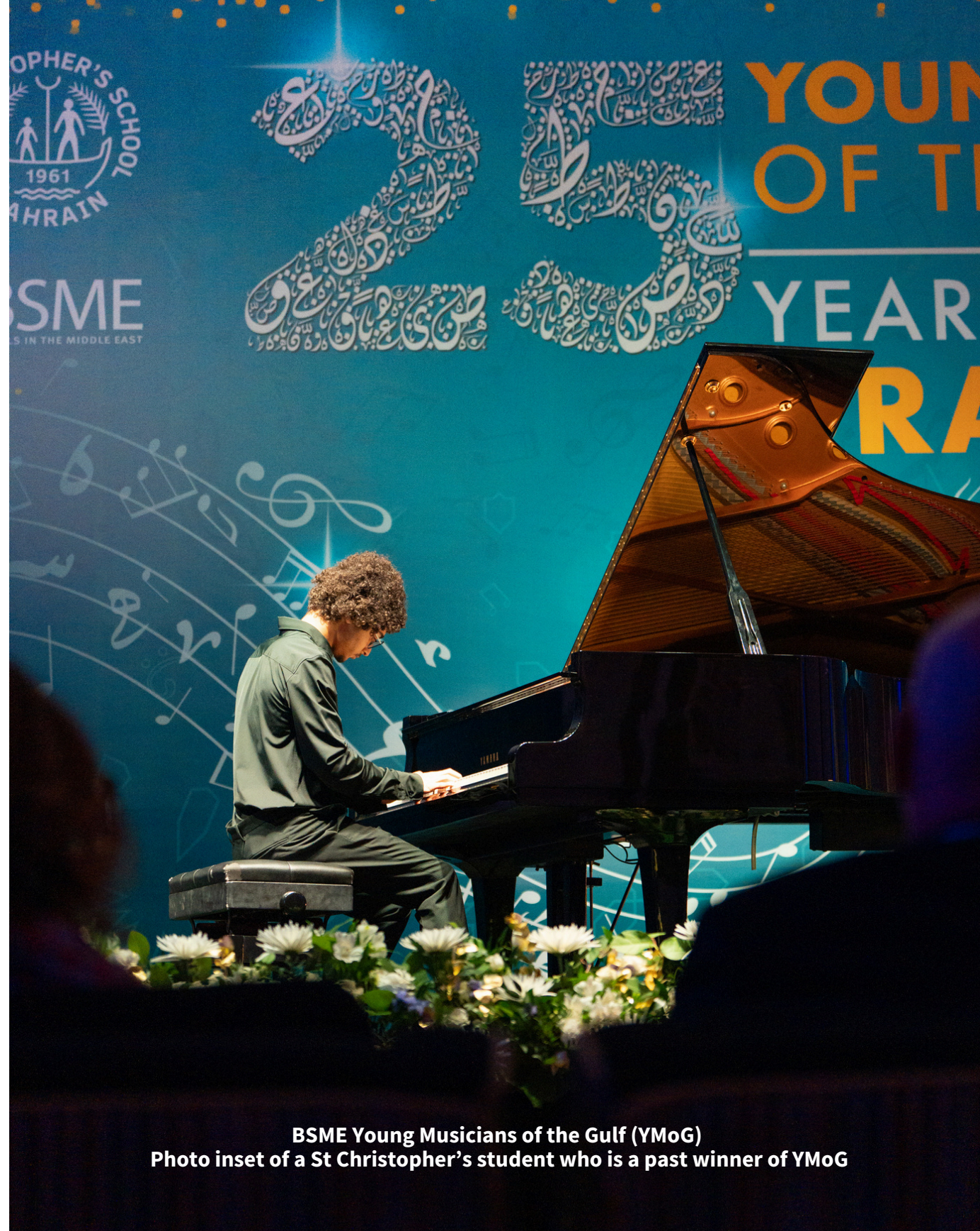
BSME Young Musicians of the Gulf (YMoG) Photo inset of a St Christopher's student who is a past winner of YMoG