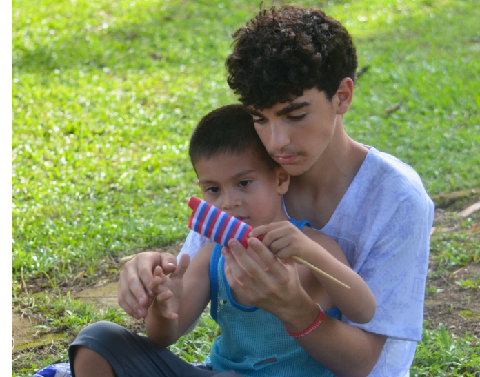
Year 12 & Year 13 Community Service Trip, Thailand

Taking action to tackle among others, poverty, inequality, climate change, environmental degradation, conflict and injustice.