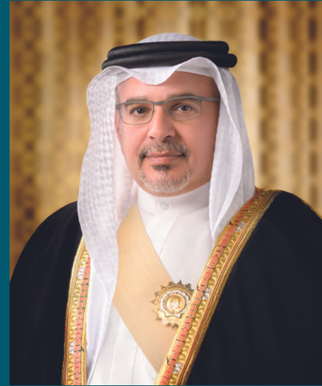
His Royal Highness Prince Salman bin Hamad Al Khalifa Crown Prince, Deputy Supreme Commander and Prime Minister