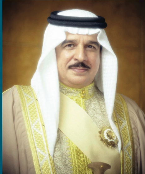
His Majesty King Hamad bin Isa Al Khalifa King of the Kingdom of Bahrain