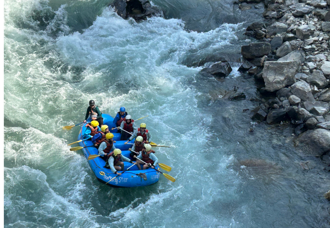
Year 10 & Year 11 Borneo Camp and Adventure