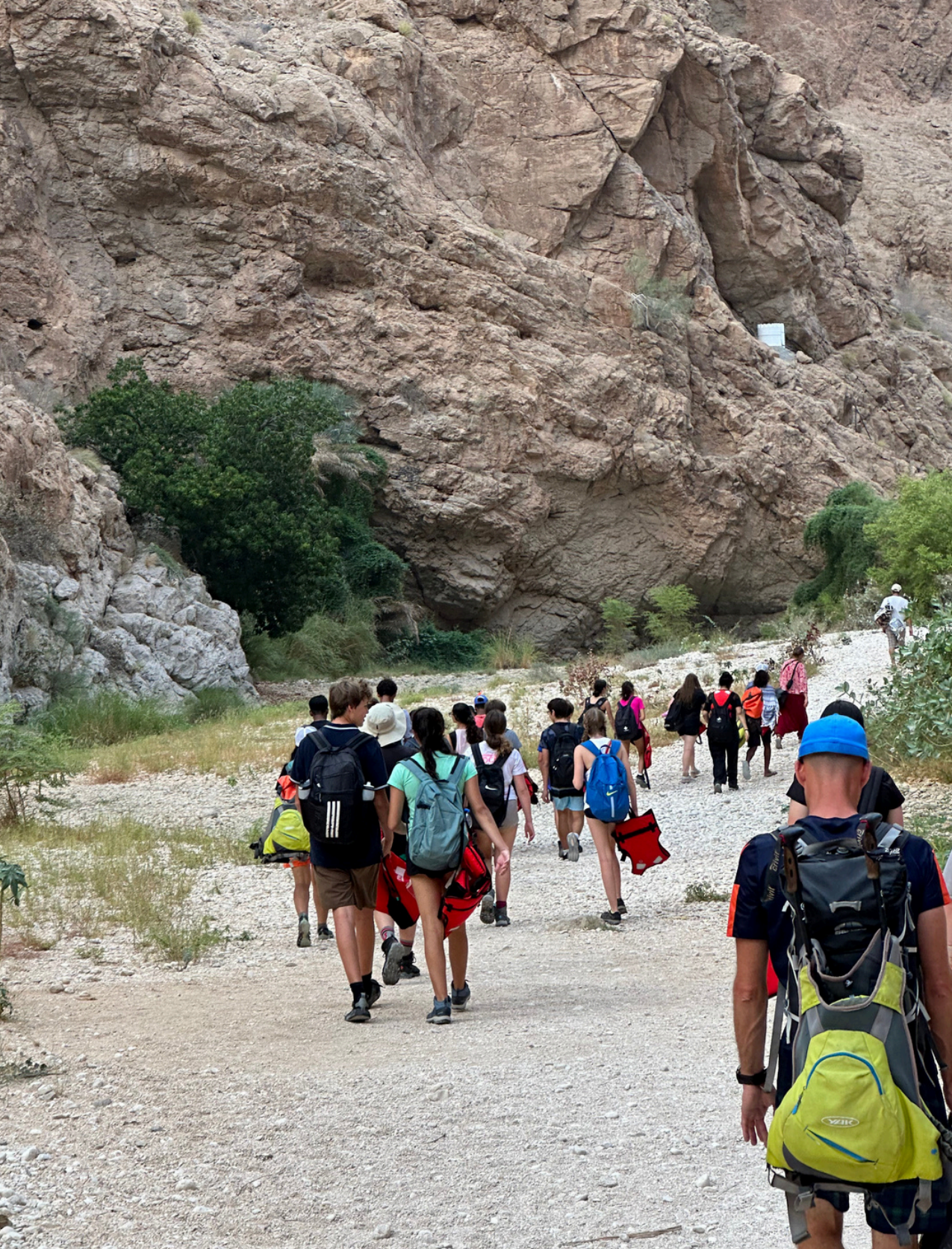
Silver Duke of Edinburgh Award, Oman