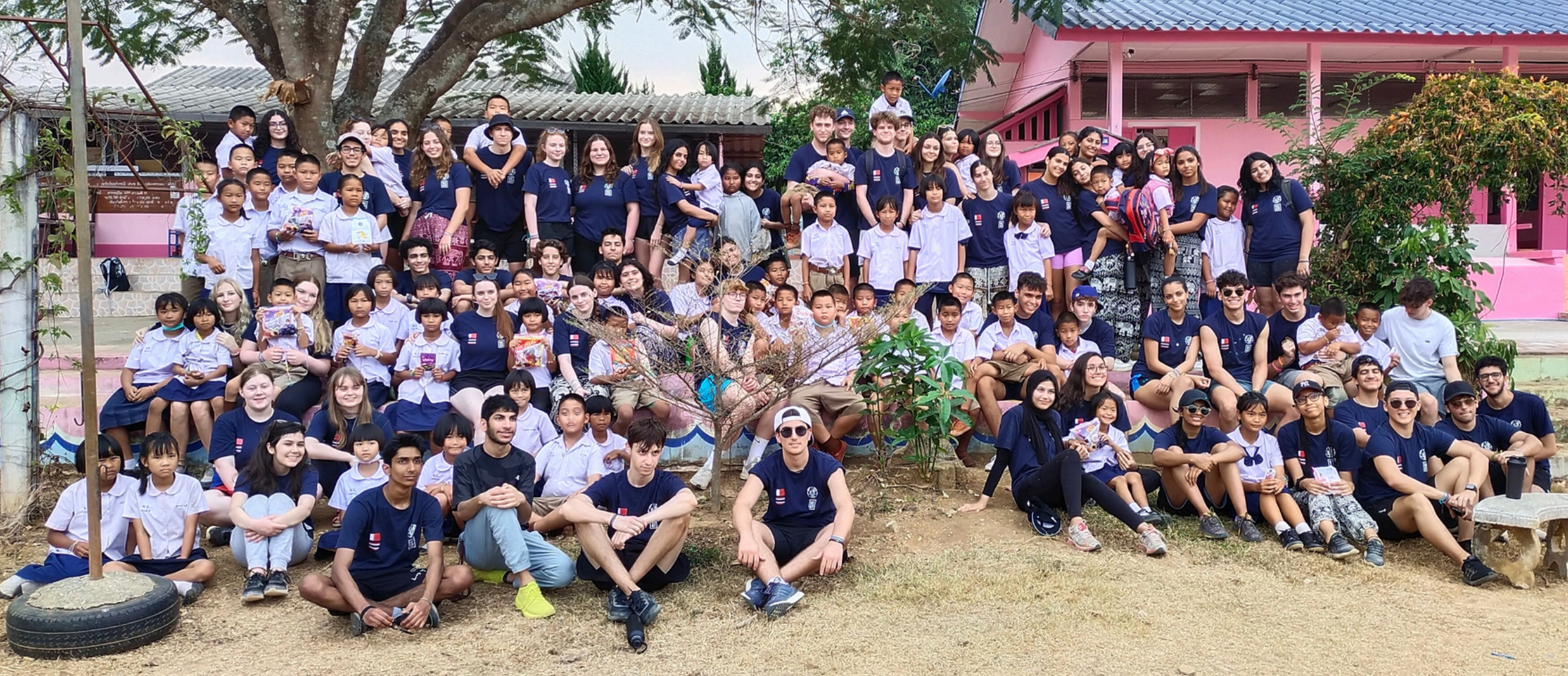
Year 12 & Year 13 Community Service Trip, Thailand