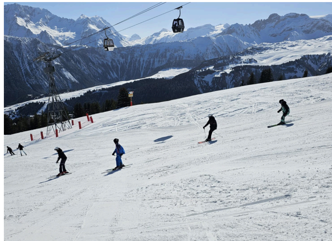
Year 7 to Year 13 Ski Trip, France